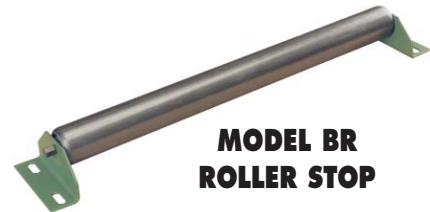
MODEL BR ROLLER STOP

*Specify 138G, 196S, 196G, 192S, 199S, 254S, 251S or 297S.